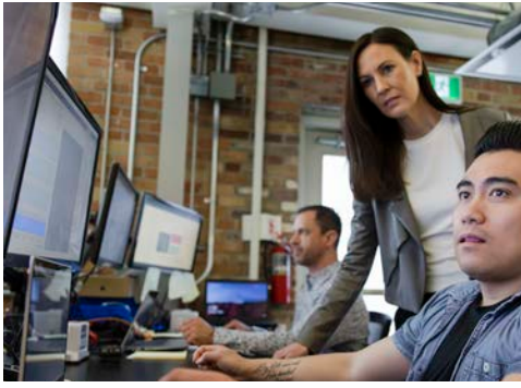
Dedicated Implementation and Client Success teams

Access to the Blackline Support Center for tools, resources and how-to-guides for all our products and services