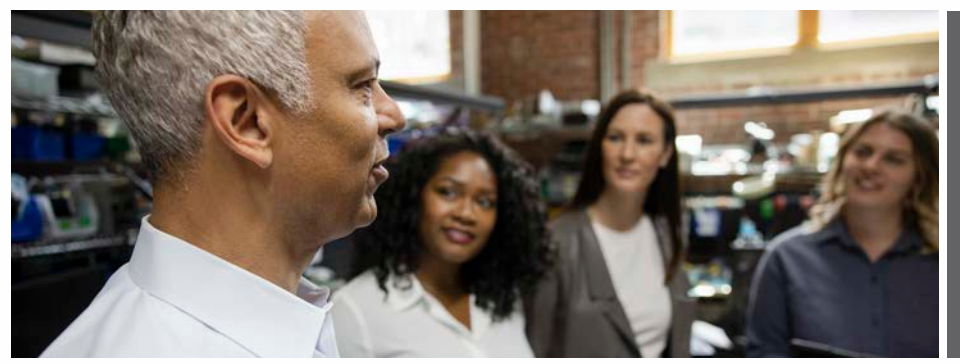
Ongoing best practices, insights and support to help optimize your safety program

Access to the Blackline Support Center for tools, resources and how-to-guides for all our products and services