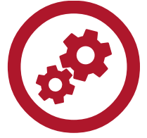
Easy inlet configuration