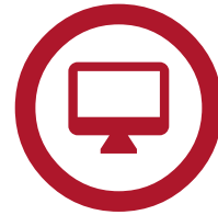
Blackline Live™ web portal