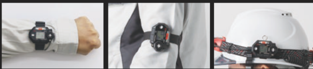
Attached to wrist (wristwatch type) *Attached to watch band