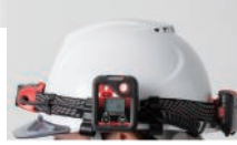
Example showing mounting on band attached to helmet

AAA alkaline batteries (x2) Part No.: 2757 0001 90