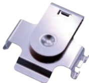
Helmet mounting clip 2 Part No.: 4732 4978 10