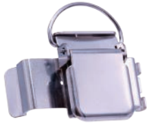
Alligator clip Part No.: 4711 7111 10