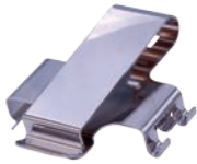
Belt clip (x1) Part No.: 4123 6463 30