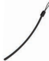
Hand strap Part No.: 0888 0605 90