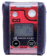
Heat-resistant case 1 Part No.: 4732 5029 70