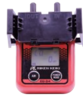
Example showing calibration adapter attached