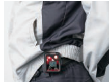
Attached to belt