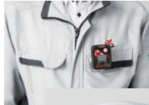
Attached to breast pocket