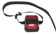
Arm band Part No.: 4123 9703 10