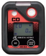
Protection cover (x1) Part No.: 4123 6450 20