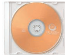
Data logger management program Part No.: 9811 0940 20